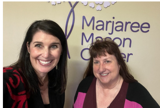
Rotary Members taking care of business on Biz Day